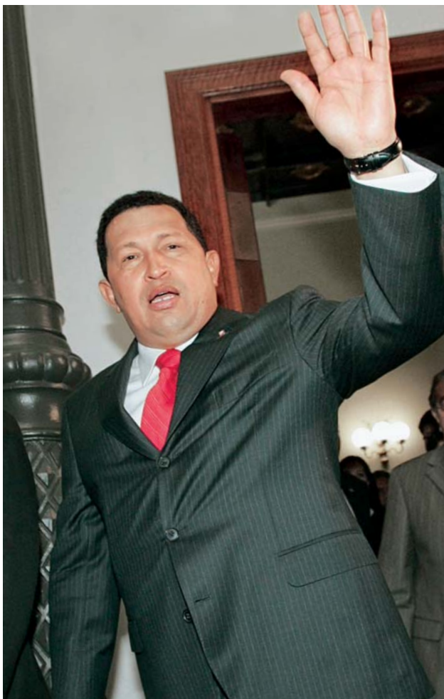
CCI Russia has become a pioneer in establishing trade and economic relations with Venezuela.

Venezuelan President Hugo Chavez during the Russian-Venezuelan business forum.