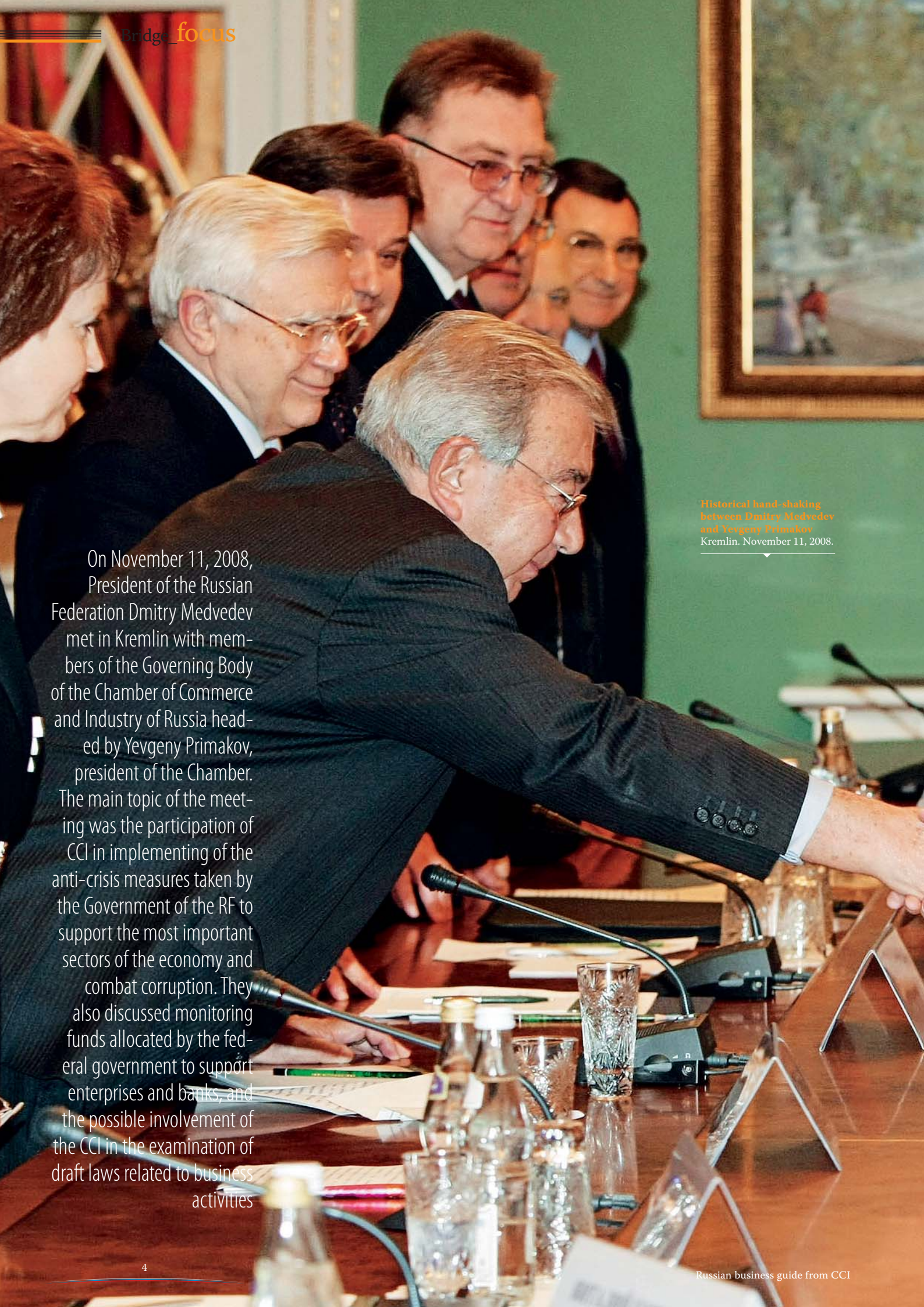
Historical hand-shaking between Dmitry Medvedev and Yevgeny Primakov Kremlin. November 11, 2008.

On November 11, 2008, President of the Russian Federation Dmitry Medvedev met in Kremlin with members of the Governing Body of the Chamber of Commerce and Industry of Russia headed by Yevgeny Primakov, president of the Chamber. The main topic of the meeting was the participation of CCI in implementing of the anti-crisis measures taken by the Government of the RF to support the most important sectors of the economy and combat corruption. They also discussed monitoring funds allocated by the federal government to support enterprises and banks, and the possible involvement of the CCI in the examination of draft laws related to business activities