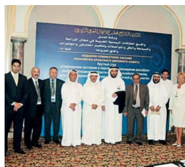
Five years ago, Yevgeny Primakov initiated the establishing of the Russian-Arabic business council. Among its goals are to exchange information, create a permanent forum for business contacts, reveal problems on the way of Russian exporters, support Russian businesspeople working in the East and Arabian entrepreneurs operating in Russia and, as a result, stir up the development of business cooperation.

as well as CCI missions in Germany and Hungary. Notably, there are two joint Chambers of commerce functioning in Europe. These are the Russian-British Chamber of Commerce and the Italian-Rus-