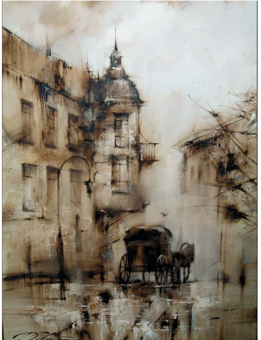
Denis Oktyabr. Old town.